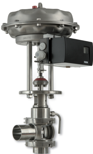
SVP Select Control Valve with pneumatic membrane actuator