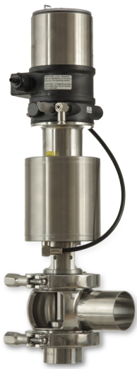
SVP Select Control Valve with pneumatic SVP standard actuator