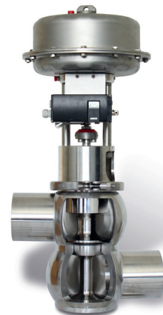
SVP Select Control Valve XL with pneumatic membrane actuator