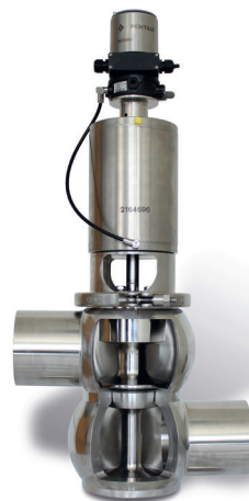
SVP Select Control Valve XL with pneumatic SVP standard actuator