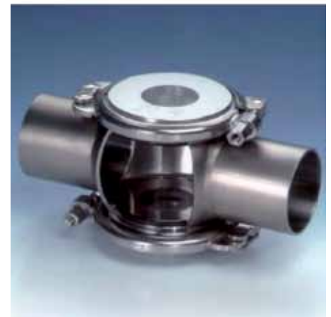
Pentair Südmö Inline-Housing with Sight Glasses